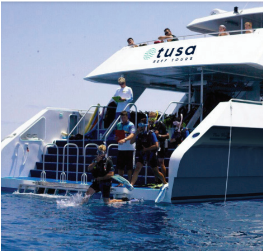
All Inclusive Tour