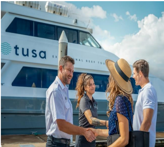
All Inclusive Tour